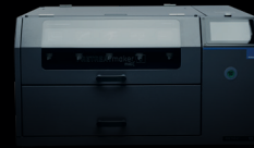
PRETREATmaker max 5