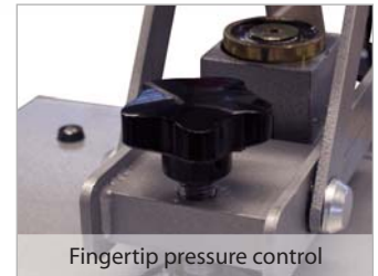
Fingertip pressure control