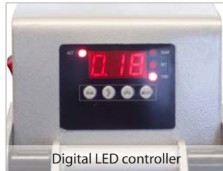
Digital LED controller