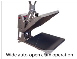
Wide auto-open clam operation